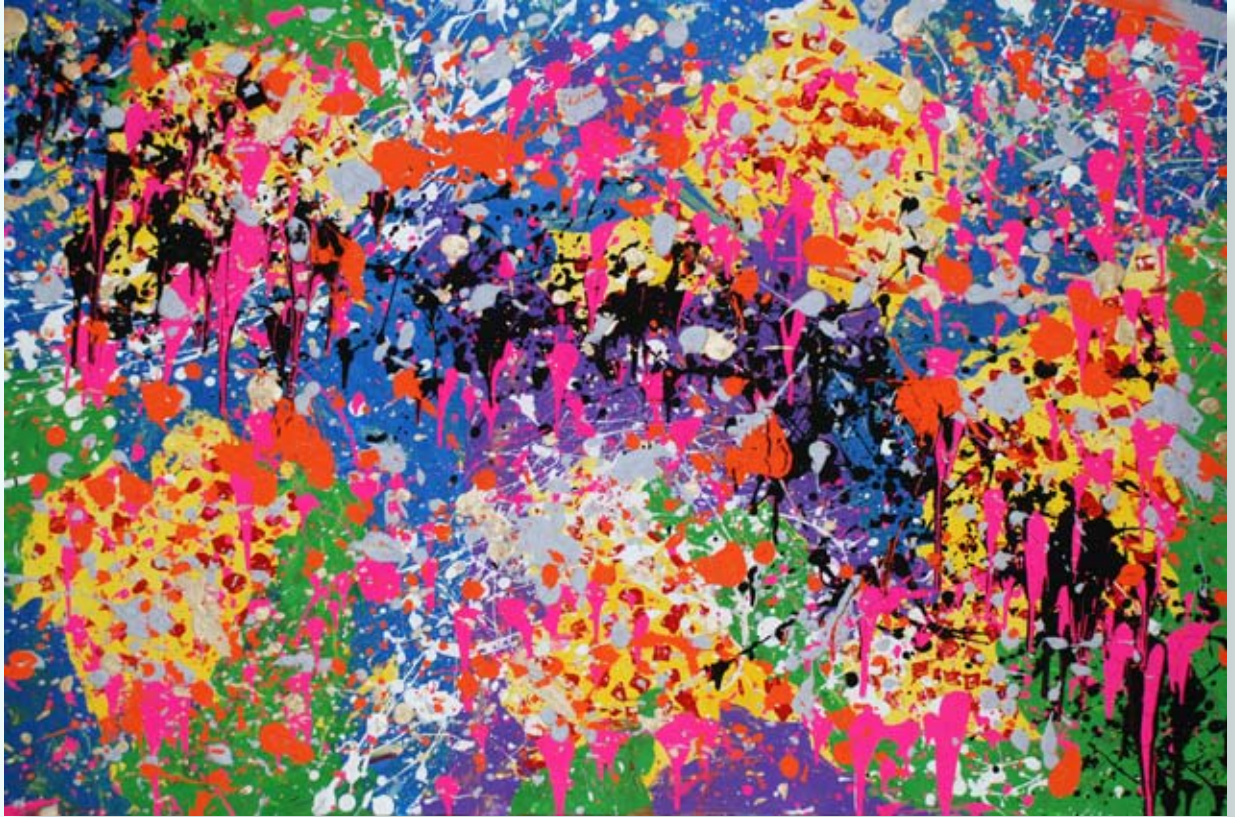
Untitled , 2008, Acrylic on canvas, 24" x 36"