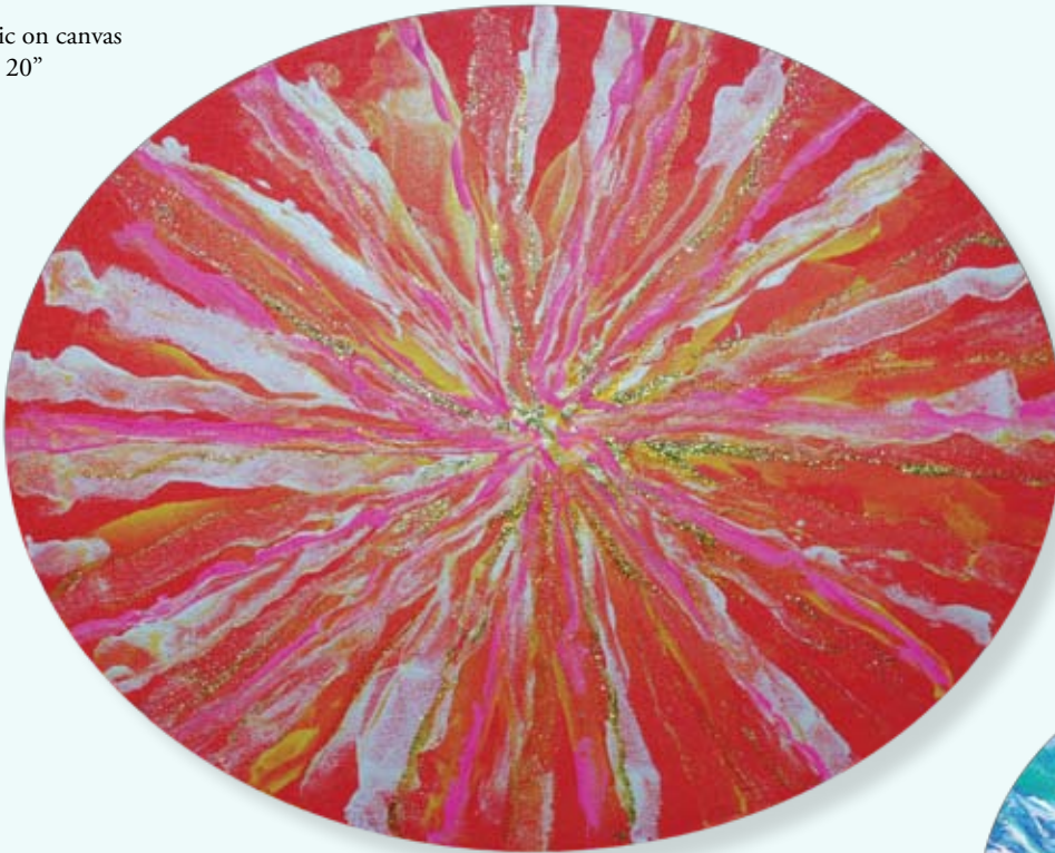
Untitled , 2008, Acrylic on canvas, 16" x 20"