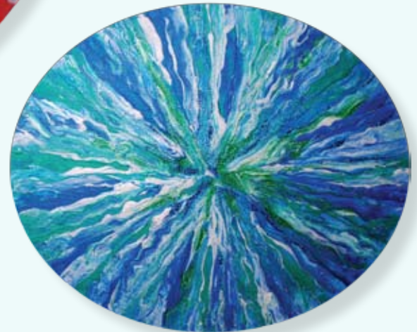
Untitled , 2008, Acrylic on canvas, 16" x 20"